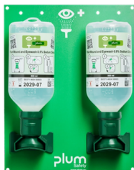
EP 4000 + EP 4604

1x 500ml PLUM Eyewash (EP 4604) 1x Wall Mounted Eyewash Station