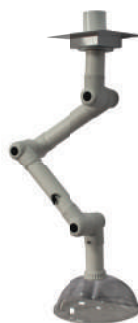
Local Extractor System Arm Hoods