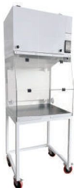
Ductless Fume Hoods