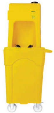
Portable Eyewash Station