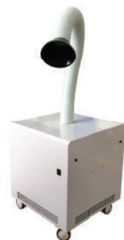
Portable Arm Hood