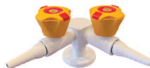
Safety Lift and Turn Gas Taps