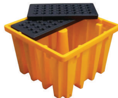
IBC Spill Pallets