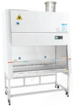
Biosafety Cabinet Class II Type B2