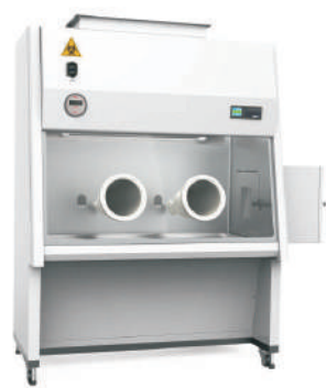
Biosafety Cabinet Class III