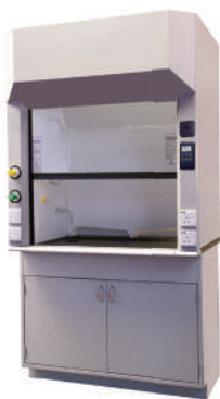
Ducted Fume Hoods