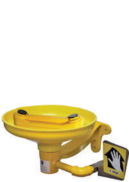
Wall Mounted Eyewash