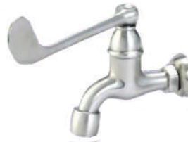
Wall Single Faucet