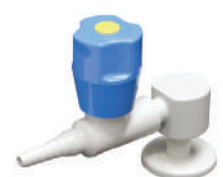
Bench Technical Gas Taps