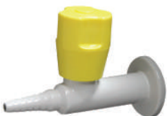
Wall Mounted Gas Taps