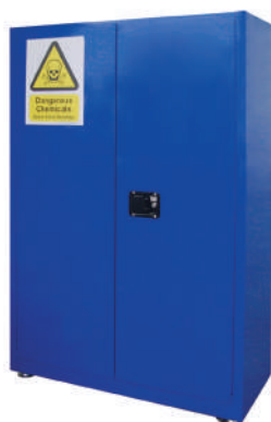
Chemical Safety Cabinet