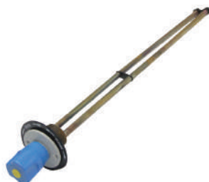
Fume Hood Gas Fittings