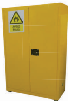
Flammable Safety Cabinet