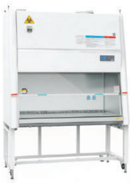
Biosafety Cabinet Class II Type A2