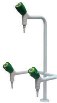
Standard Bench Water Taps