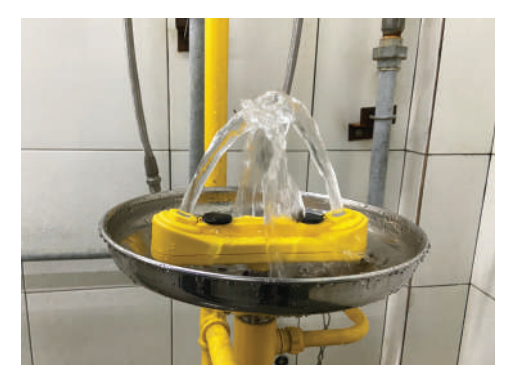
Consistently achieve perfect stream