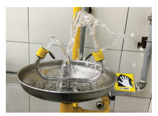
Occasional unbalanced water stream