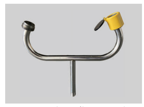
Parts can be easily tampered or removed