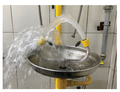
Unchecked pressure leads to messy and wet surroundings