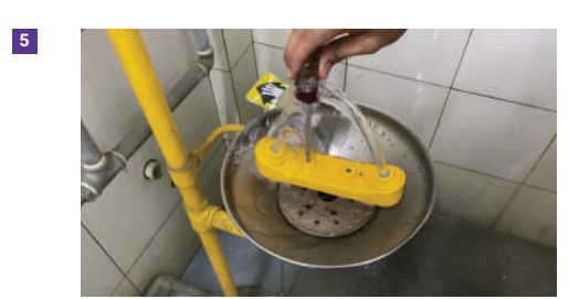
Turn gently until desired stream is achieved. Do not force when fully turned. Turn off eyewash and reactivate after 5 seconds. Check result of adjustment.