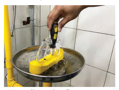
Manually regulate flow to ensure steady stream regardless of pressure