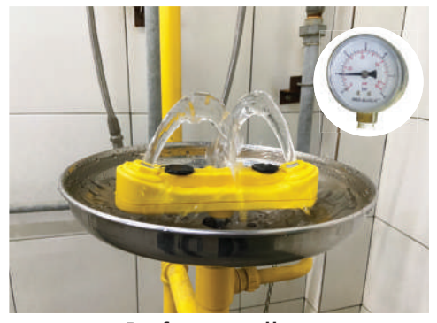
Performs well at approximately 1 bar