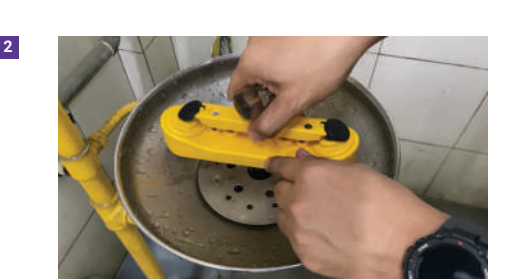
Use Philips head screw driver to remove regulator lid.