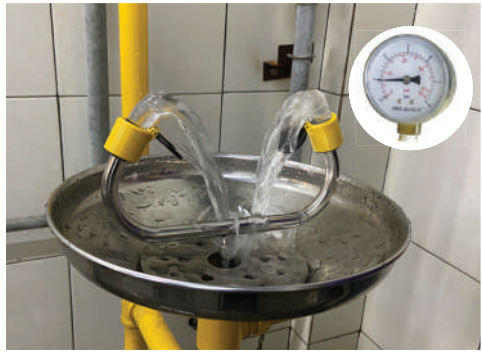
Requires supply pressure of 2 bar or more