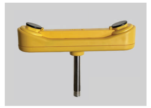
Uniquely designed to reduce risk of tampering

*IM-55-AV1X eyewash is suitable with previous Method eyewash and shower model.