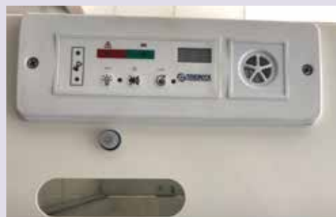
Filter & Air Flow Alarm