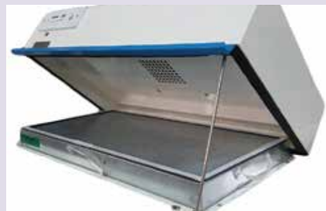
Easy Filter Replacement System